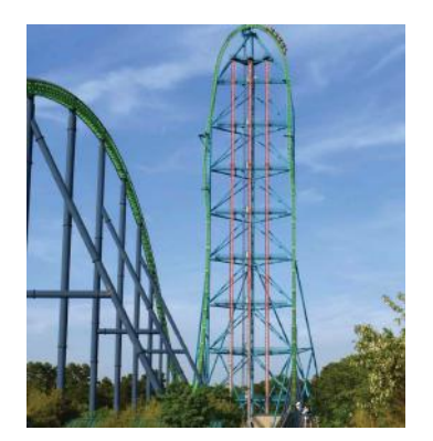
Kingda Ka--Six Flags